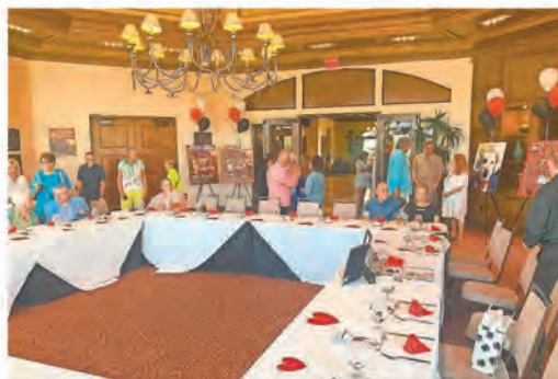
Paws & Hearts held its anniversary luncheon at The Classic Club on April 15, 2025.