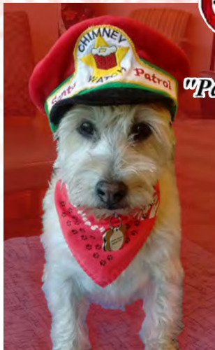
"Lucky" (Left) and "Scruffy" (Right) the Founding Canine Ambassadors!