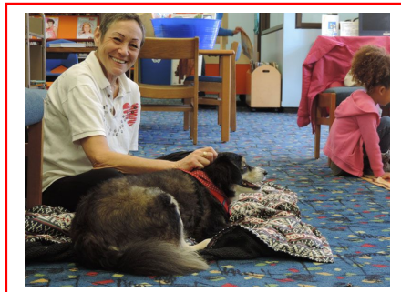
Examples of awesome human volunteers!