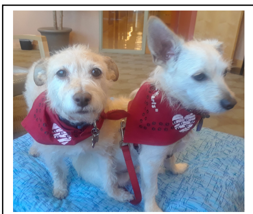
"Maddie" & "Bingo"