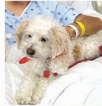
Pet therapy can help relieve physical and emotional pain and teach children to be kind to animals.

Paws & Hearts is a nonprofit that focuses on providing pet therapy to people in hospitals in Palm Desert. The organization is encouraging people of Palm Desert to bring their dogs if they believe they would be good pet therapy dogs. For more information on pet therapy, visit pawsandhearts.org .