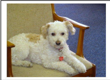
Lucky, the dog who started it all!